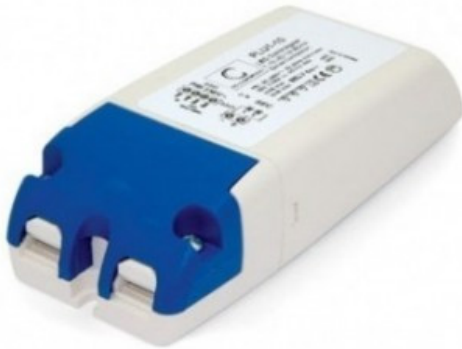
350mA constant current LED Driver