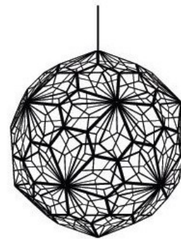
60 / 23.6"