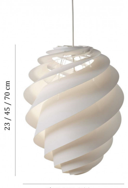
Ø18 / 36 / 55 cm